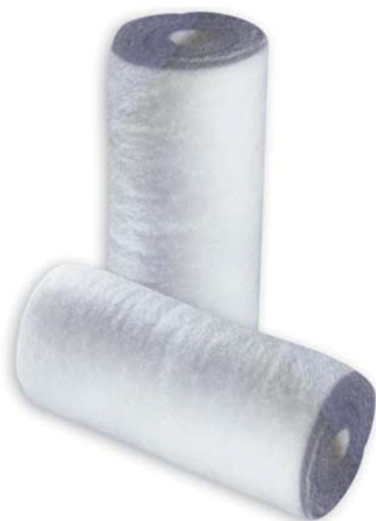
Figure 1: Aquatrex Filters